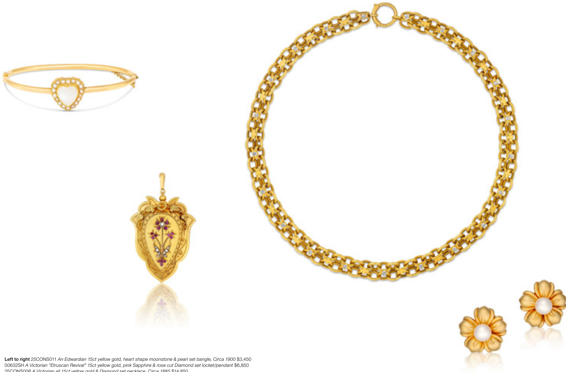
Left to right 25CONS011 An Edwardian 15ct yellow gold, heart shape moonstone & pearl set bangle, Circa 1900 $3,450 00632SH A Victorian "Etruscan Revival" 15ct yellow gold, pink Sapphire & rose cut Diamond set locket/pendant $6,850 25CONS006 A Victorian all 15ct yellow gold & Diamond set necklace, Circa 1885 $14,850 00651VE A pair of Estate 14ct yellow gold & South Sea pearl floral style clip-on earrings with posts $5,850