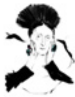
The Jewels & Possessions of Dame Edith Sitwell, DBE

Check out my events page to find out when I am speaking next. www.circaADjewels.com/event-list