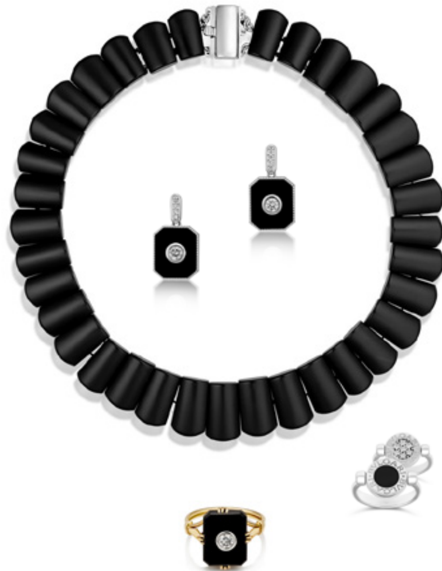
Top to bottom 00778VN A graduating slightly cabochon black Onyx "Tablet" necklace on silver snap fastener $1,250 00779VE A pair of 14ct white gold, black Onyx & Diamond "Tablet" style drop earrings $4,400 24CONS003 An Estate 18 carat white gold Bvlgari black Onyx & Diamond "Flip" ring $3,450 00679SH A Vintage 18ct yellow & white gold black Onyx and Diamond "tablet" ring $3,450