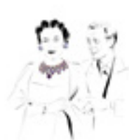
The Jewels & Style of The Duke & Duchess Of Windsor