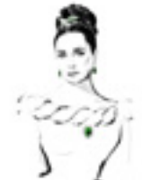
Elizabeth Taylor's Greatest Love Affair—With Jewels