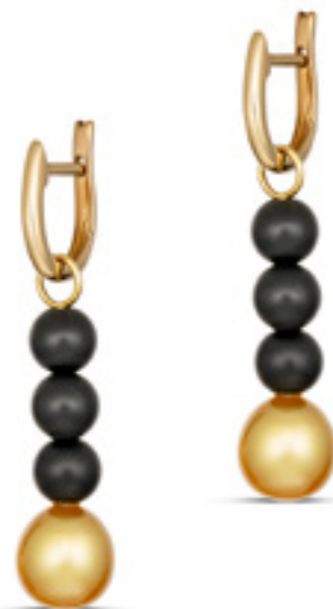
Left to right 00691VN A rope of golden South Sea pearl & matt black Onyx beads $2,850 00721VE A pair of 9ct yellow gold matt black Onyx & golden pearl "detachables" drop earrings $975