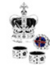
The Jewels of a British Coronation