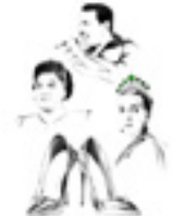
Bejewelled Treasures Owned By The Discerningly Wealthy