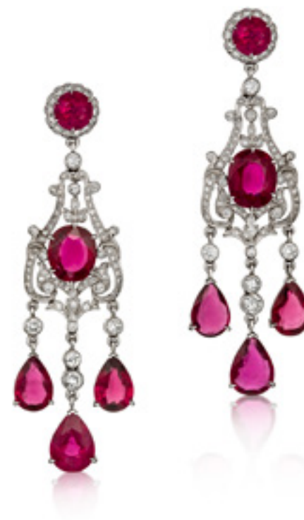
25CONS038 A pair of Estate 18ct white gold red Tourmaline & Diamond "Girandole" style drop earrings $19,800