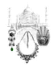
India's Beautiful, Historic & Ever-Changing Jewels