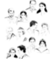
Six Young British Royals & Their Wedding Jewels