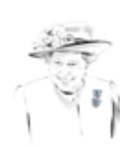
Her Majesty Queen Elizabeth II's Platinum Jewels