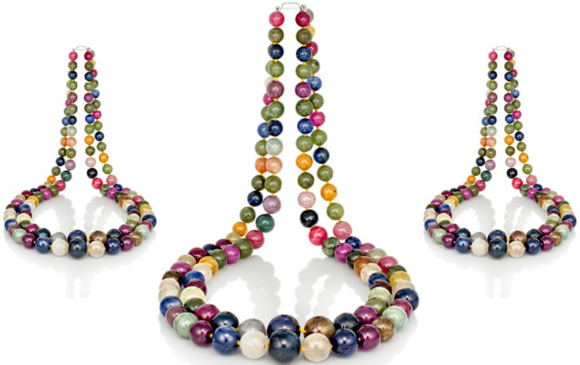
00754VN A double row of graduating multi-coloured natural Sapphires on sterling silver snap fastener $4,650