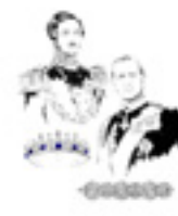
The Royal Jewels of Two Prince Consorts