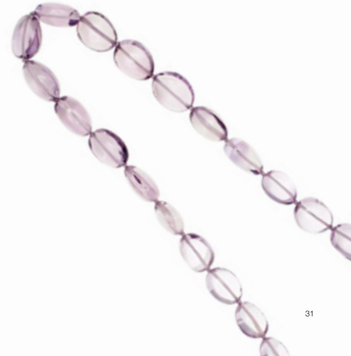
Left to right 00759VN Two ropes of lavender Amethyst pebbles $1,175 each 25CONS034 An Estate 18ct yellow & white gold large oval Amethyst & Diamond cluster ring $7,700 00294VE A pair of sterling silver double Lavender Amethyst "Pebble" drop earrings $365