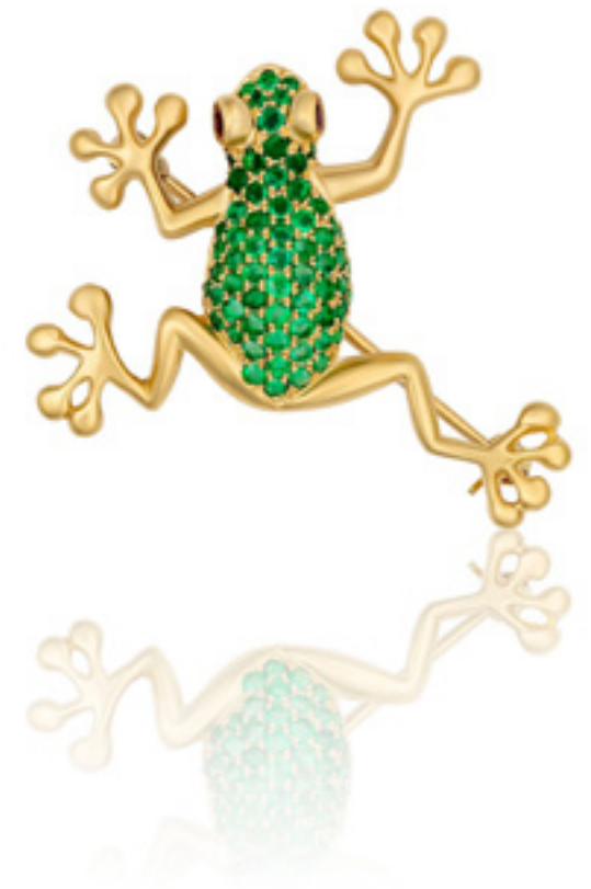
25CONS029 A modern Melbourne-made 18ct yellow gold pave Emerald set "Frog" brooch with Ruby set eyes $8,650