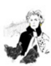
The Jewels of Deborah, Duchess of Devonshire