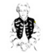
The Brooch is Back!