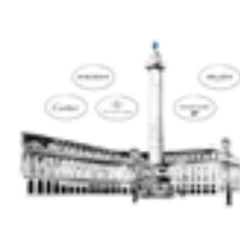
A History of the Finest French Jewellery Houses