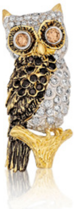
25CONS030 A modern Melbourne-made 18ct yellow & white gold Diamond, cognac Diamond & black Diamond set "Owl" brooch $11,850