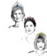
Tiaras: Significance & Allure