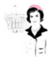
Jacqueline Bouvier Kennedy Onassis