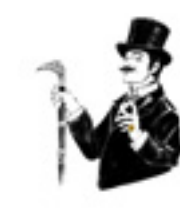
Suave & Sophisticated