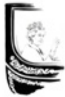
The Late Queen's Private Diamond Collection