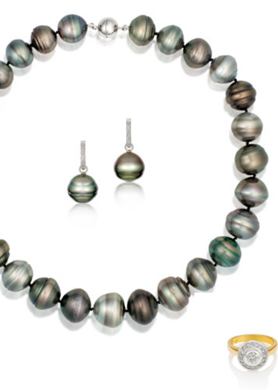
Top to bottom 0774VN A button & circled Tahitian pearl necklace on sterling silver magnetic ball clasp $6,850 00780VE A pair of 18ct white gold Diamond set huggies with detachable Tahitian pearl drops $2,985 25CONS020 An Estate 18ct yellow gold & white gold mounted all Diamond cluster ring $6,850