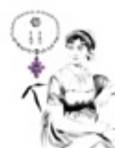
Jewels of the Regency