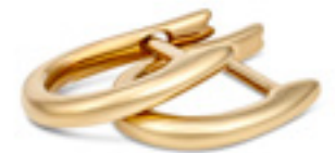
Left 00392SH An Estate 18ct yellow gold, cabochon Ruby & Sapphire set brick link style necklace $14,850 Above 00729VE A pair 18ct yellow gold "Huggie" style cuff earrings $1,750