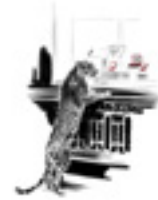
A Menagerie Of Jewels

Thus far, Circa AD Jewels has 23 talks in its ever-growing repertoire. As time allows, I research and write these talks personally. Using my extensive knowledge and library, I have developed a series of talks that are both interesting and factual, and that illustrate so much about the world of jewels.