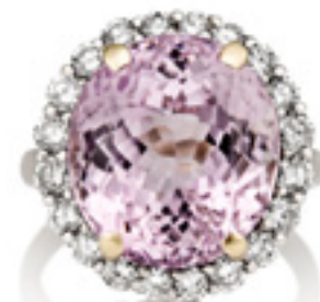
Left to right 25CONS036 An Estate 18ct white gold oval Kunzite & Diamond cluster ring $6,450 25CONS035 A pair of Estate 18ct white gold square Kunzite & Diamond cluster earrings $11,800